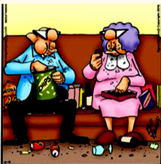
"Hurry! Our New Year's resolutions start in ten minutes."

The Church is like a great ship being pounded by the waves of life's different stresses. Our duty is not to abandon ship, but to keep her on her course. —St. Boniface