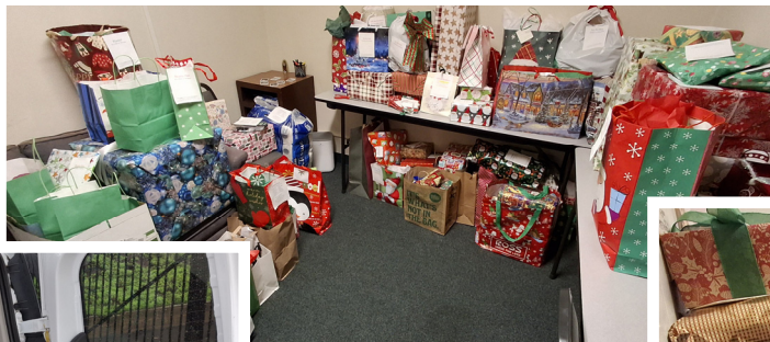
Below & Left: Two rooms in the parish offices were filled with the donated gifts.