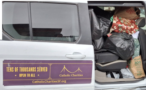
Above & Right: St. Stephen Parishioners were so generous in donating gifts that they filled the van to the roof!